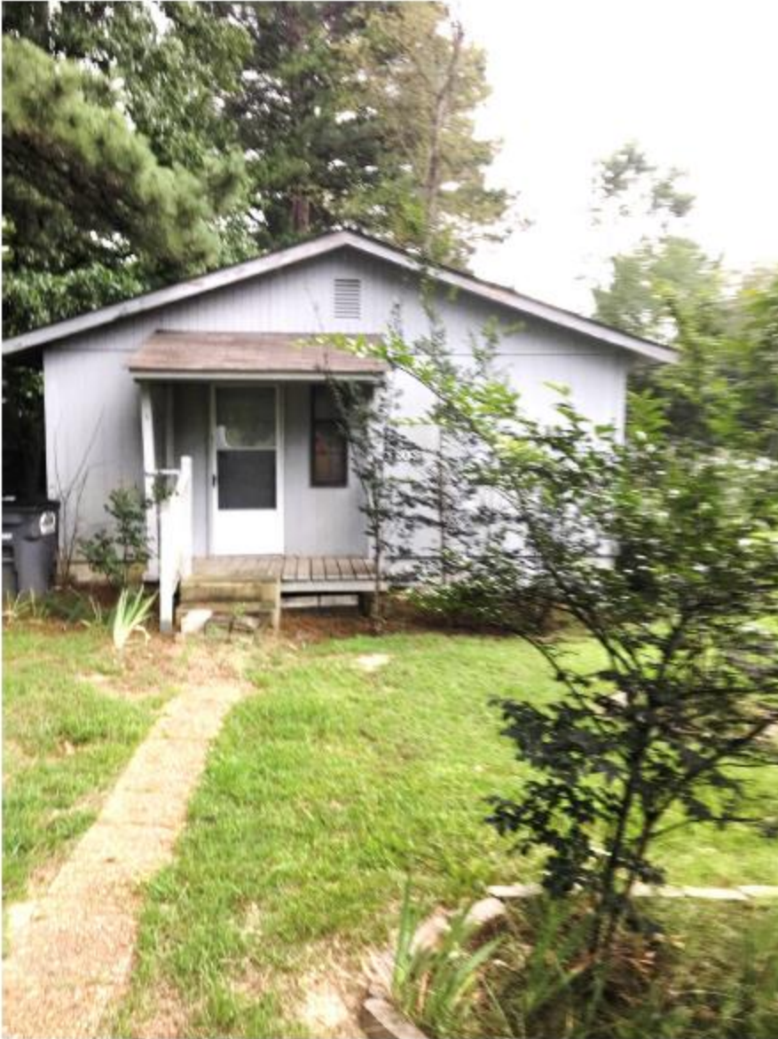
Pier to Peak: 12' 4"